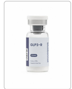
Retatrutide 20mg - BB-RETA20-2602